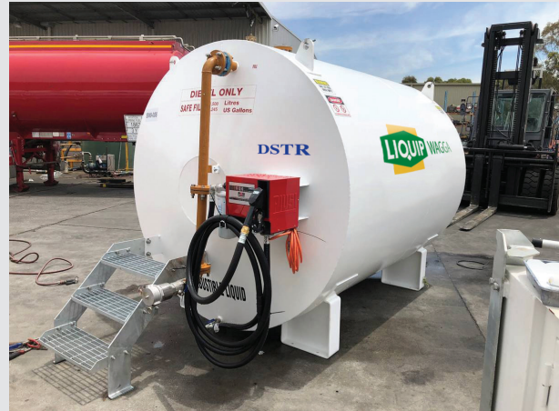
Liquip Wagga Farm Tank and fuel dispensing system